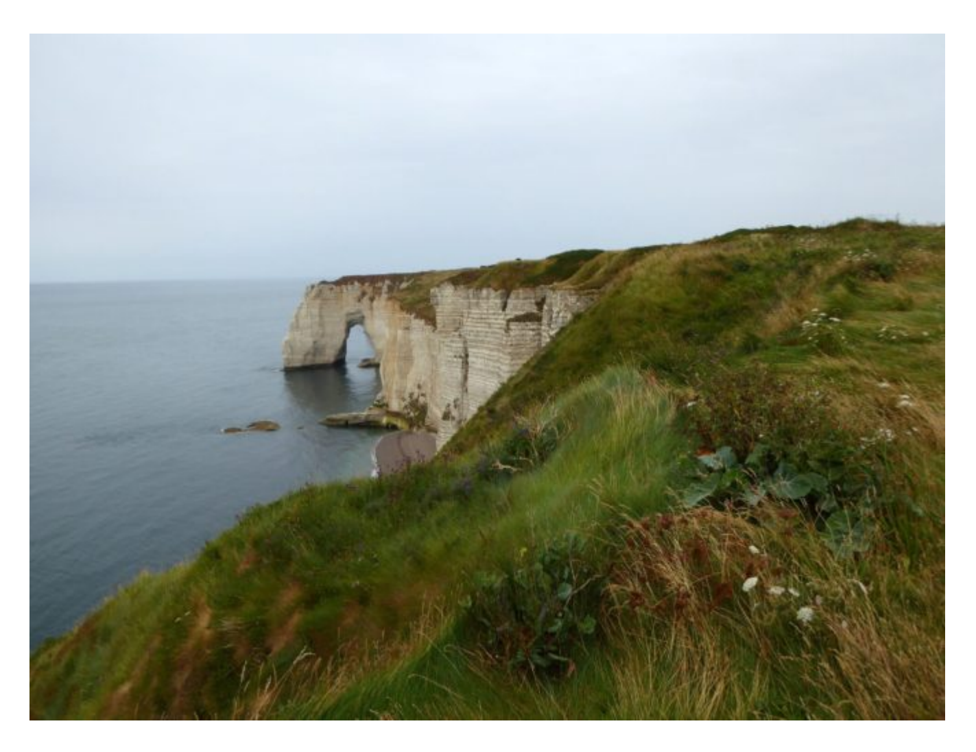
Rock formations along the Alabaster Coast

There are several interesting connections outside of the stunning white sea cliffs, and we are also hoping to tie in a stop at a local farm to sample some of the renowned local farm products of the area.[/vc_column_text][/vc_column][/vc_row][vc_row][vc_column][vc_gallery interval="0" images="8076,8074,8075,8072,8071" img_size="large"][/vc_column][/vc_row]