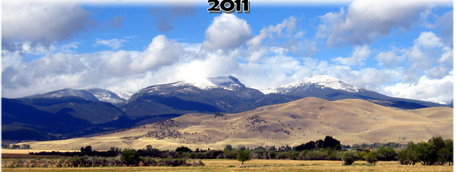
Big Sky Country—Montana

WITH WALKS AND SIGHTSEEING IN IDAHO, MONTANA, OREGON, AND WASHINGTON!