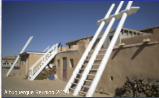
Albuquerque Reunion 2009

Walking Adventures International PO Box 871000 Vancouver WA 98687 www.walkingadventures.com