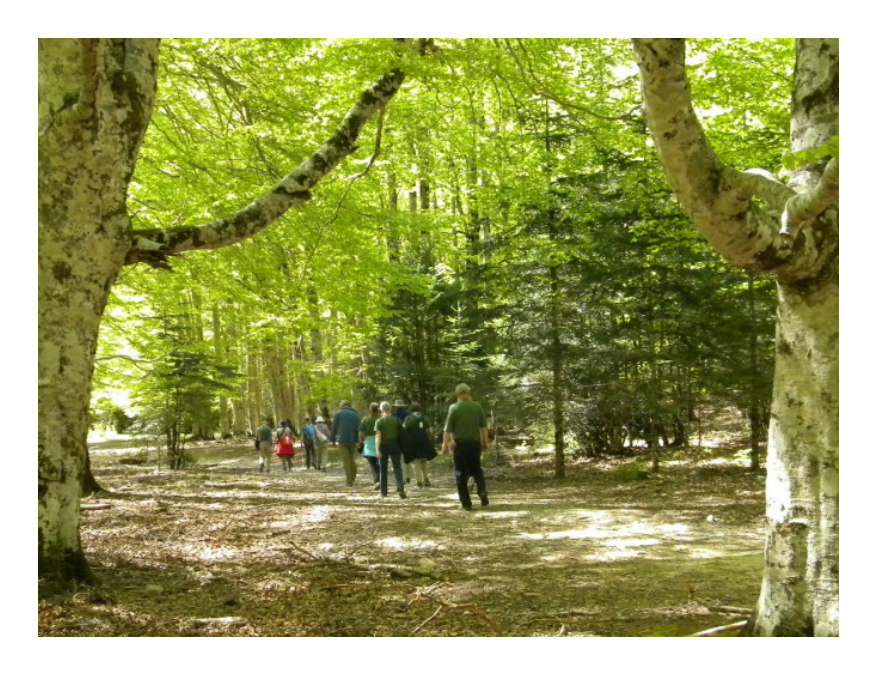
Ordesa National Park Walk