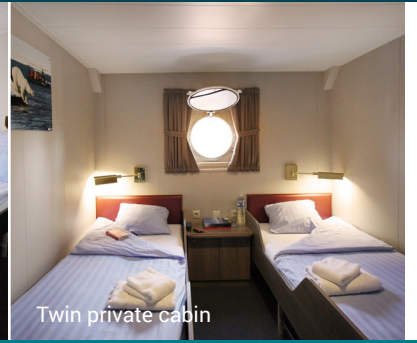
Twin private cabin