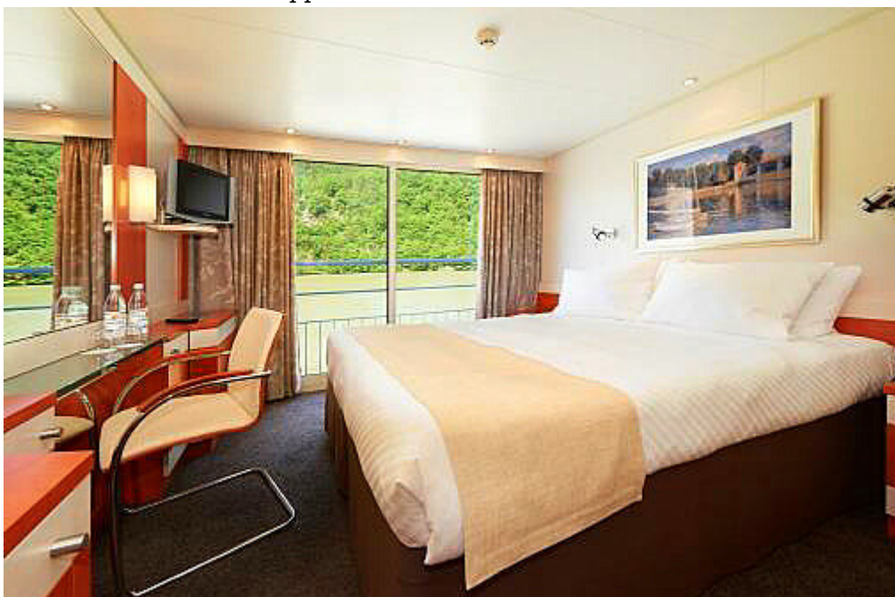
Middle & Upper Deck Cabin with French Balconies

A limited number of single cabins are available. Please contact WAI for more information.